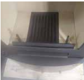
10. Fit cast iron base grate. Place log retainer.