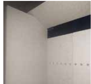
6. Place left side brick. Make shure that inner baffel is placed in its rightht position on top of the side brics.