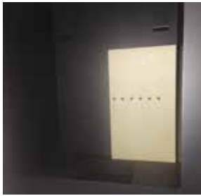
2. Place rear brick – right.