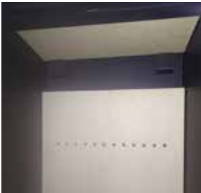
4. Place inner baffel on brackets