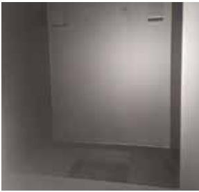
1. Clean fire champer.