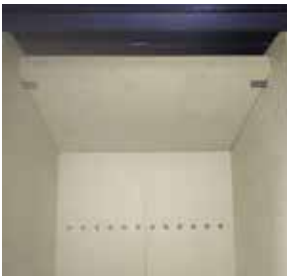
7. To fit baffle lift baffle into position over baffle support stick (left and right).