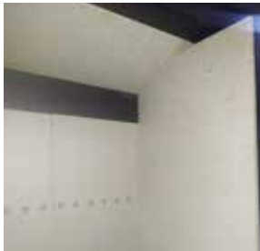
5. Place right side brick