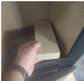
8. Place bottom brick – right.