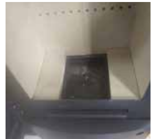
9. Place bottom brick – left.